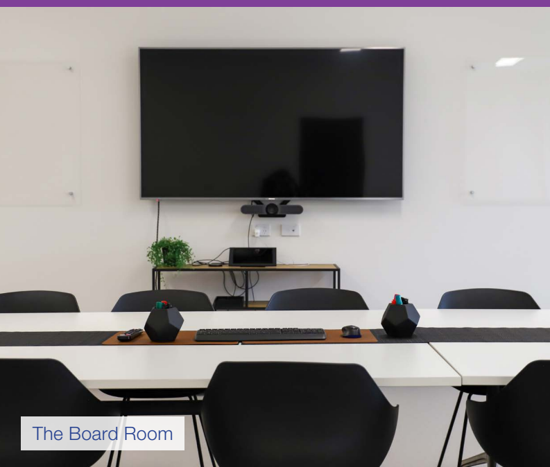
The Board Room