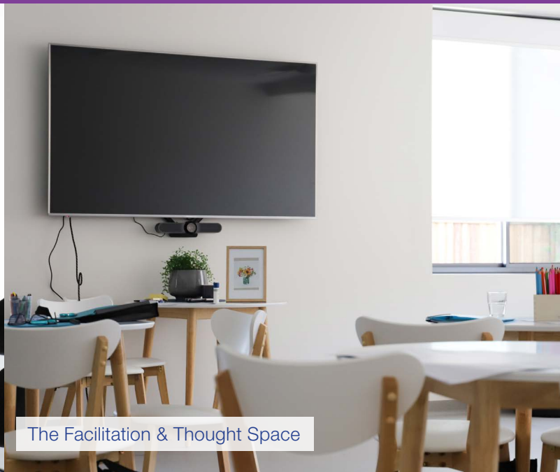
The Facilitation & Thought Space