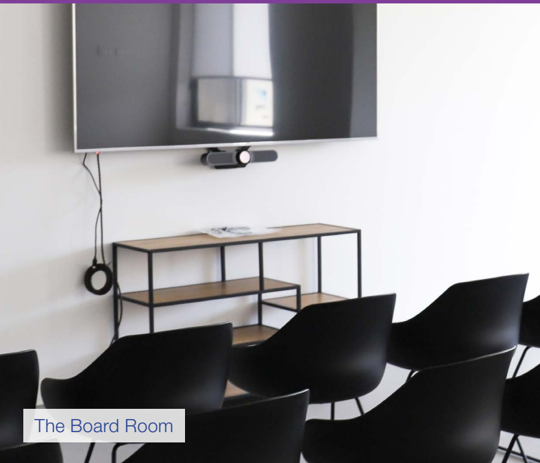
The Board Room

We are a COVID safe environment with clean spaces that allow appropriate social distancing meeting opportunities.